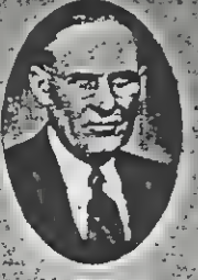
M. R. Reid Motion Pictures